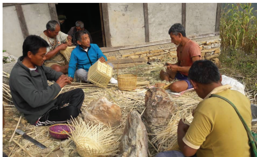
Cane & Bamboo Weaving at Chhimoong, Pema Gatshel