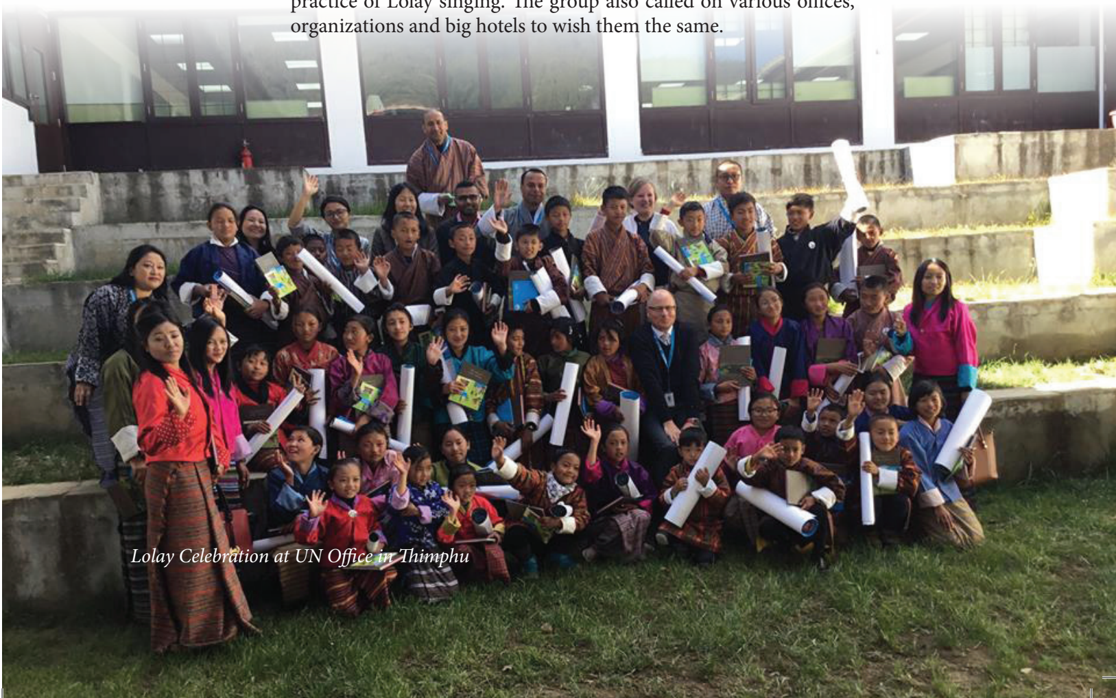
Lolay Celebration at UN Office in Thimphu

On 2 nd January 2018, a group of students selected from different schools in Thimphu called on their Majesties The King, The Gyaltsuen and His Royal Highness The Gyalsey at the Royal Lingkana Palace to wish the royal family good health, peace and happiness through practice of Lolay singing. The group also called on various offices, organizations and big hotels to wish them the same.