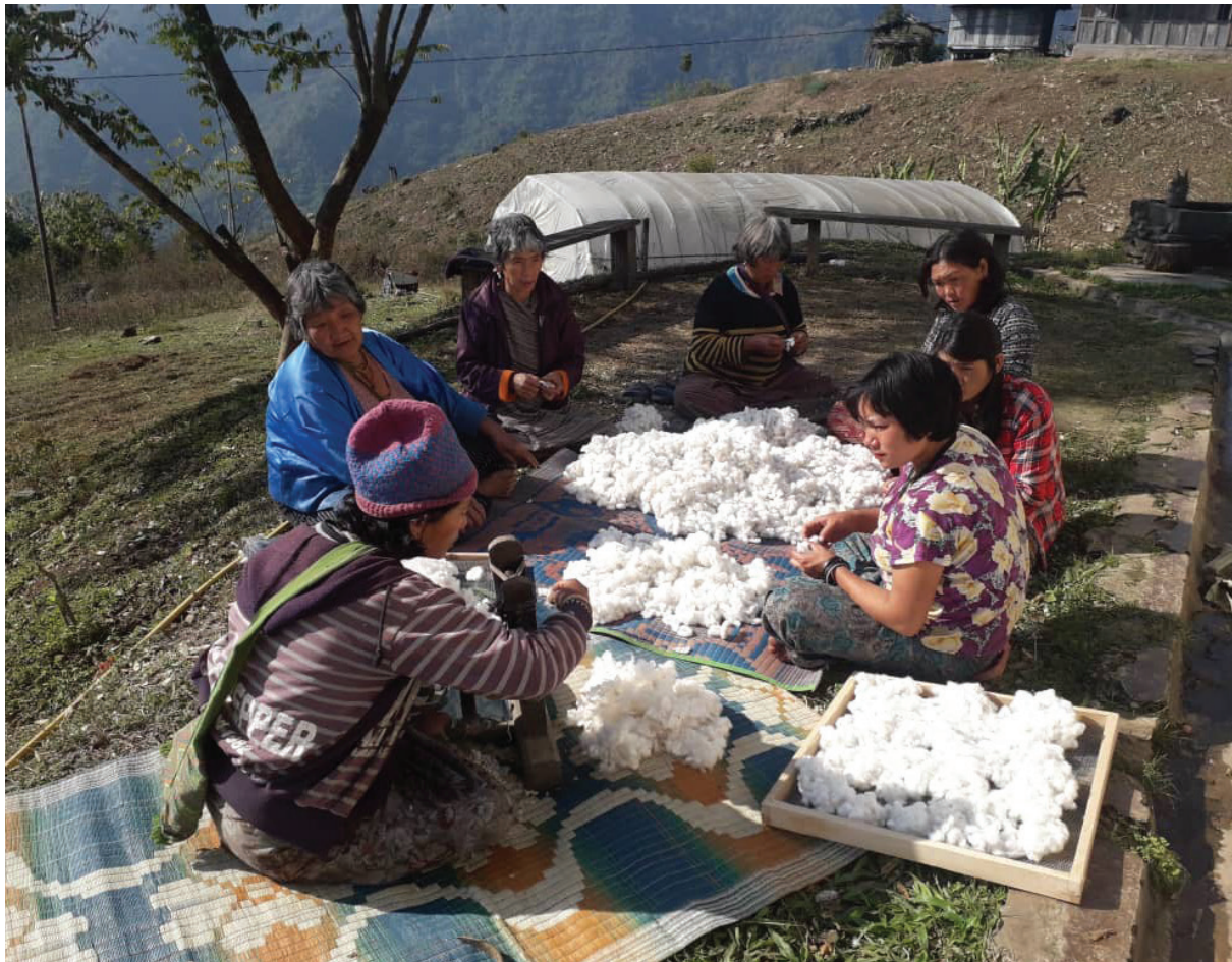
Cotton Harvest at Bangyul in Pema Gatshel