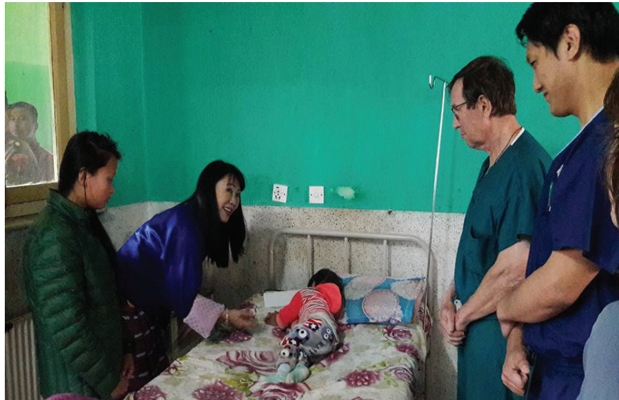
Her Majesty's visit during the 12th Surgical Camp, Paro District Hospital