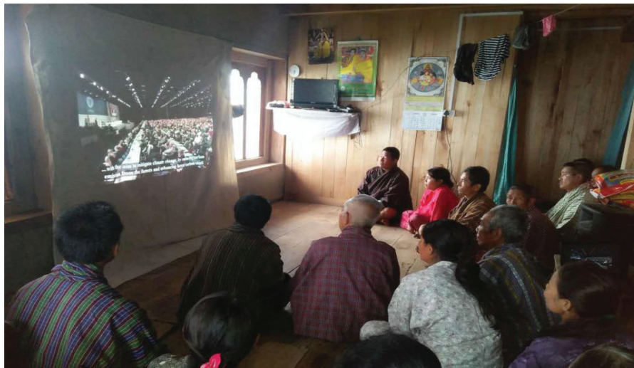
Watershed Awareness & Training at Haa

The project was funded by Forest Carbon Partnership Facility (FCPF) and executed through Tebtebba Foundation, an NGO based in Philippines. The Foundation organised awareness on REDD+, watershed management and trainings in Gakidling Gewog under Haa Dzongkhag, Chhimmoong Gewog in Pema Gatshel and Rookha Gewog in Wangdue Phodrang.