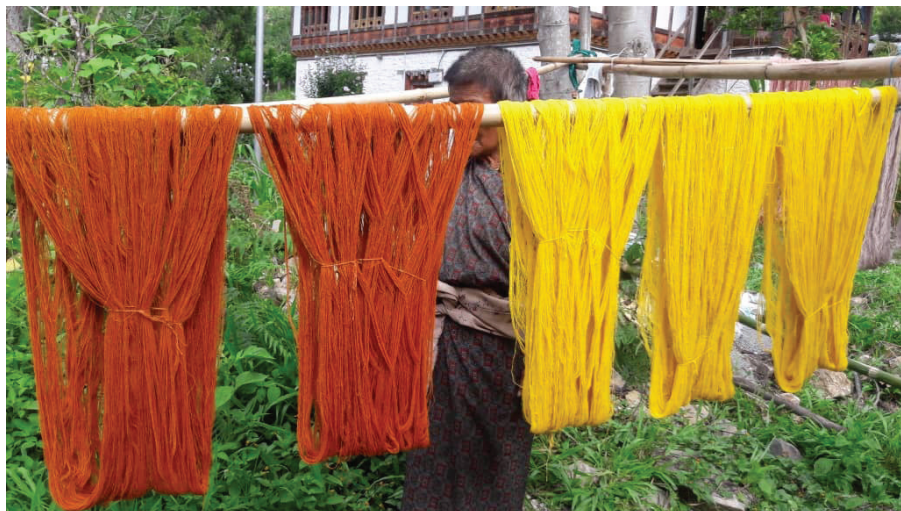
Natural Dyed Yarns at Pema Gatshel