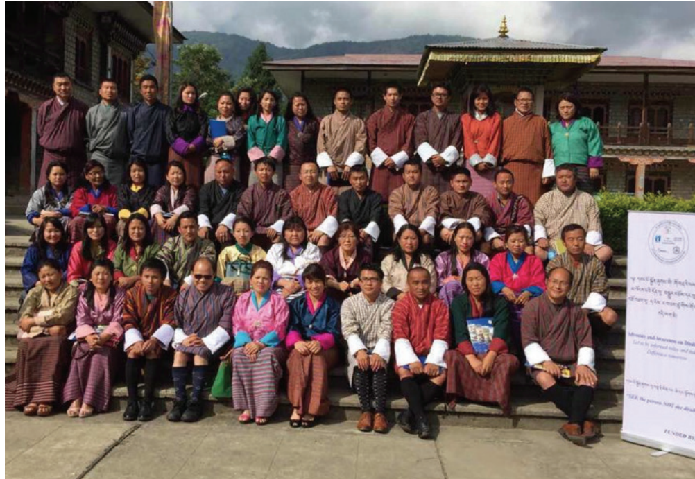
Group picture of participants of Social Inclusion Program Workshop

The Social Inclusion Program seeks to facilitate opportunities for differently-abled people to participate actively in all spheres of life. It's about expanding individuals' life opportunities through education, training and employment.