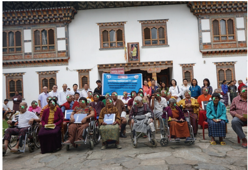
Cataract Surgery Camp in Punakha