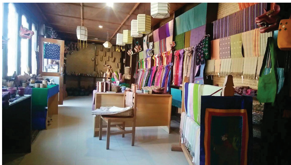
Tarayana Rural Crafts Outlet in Chabchu, Thimphu