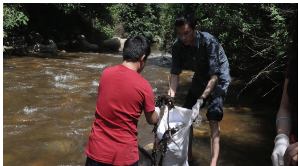
Adoption of Olarong stream by Zhenphen Social Service Committee , Royal Institute of Management(RIM)