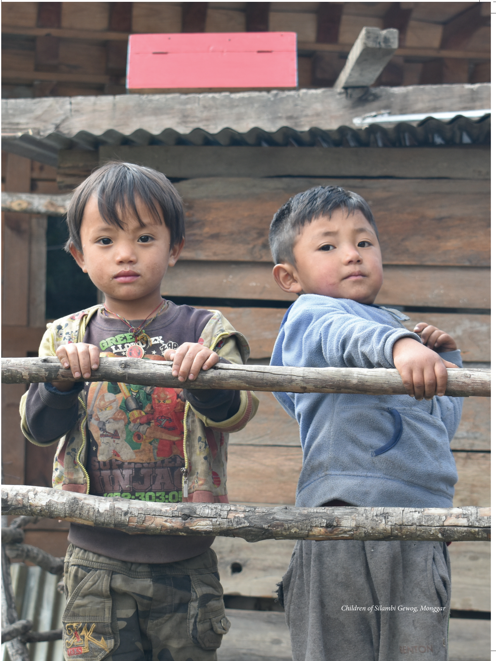
Children of Silambi Gewog, Monggar