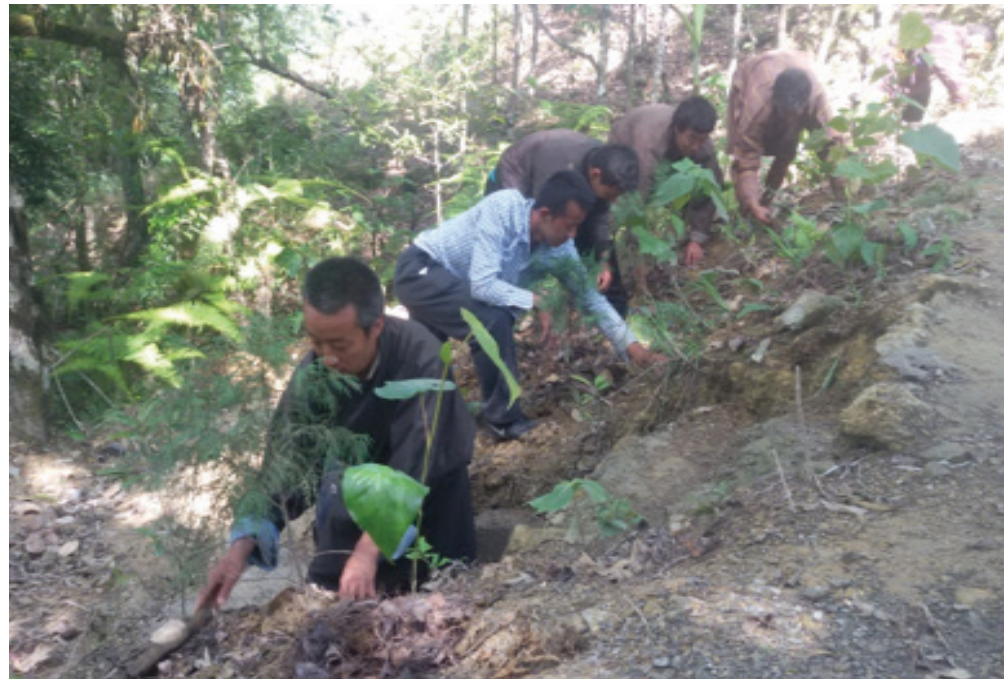
Community members of Silambi Gewog in Monggar planting Napier plants