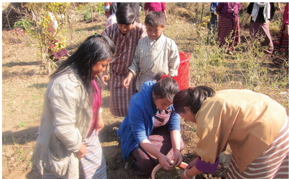
Natueco farming in the community of Chhimong, Pemagatshel

Natueco farming follows the principle of eco-system networking of nature in our farming system. It is different from organic or natural farming both in philosophy and practices. It offers an alternative to the commercial, heavy chemical techniques of farming. Along with this method of farming, incorporation and on-farm production of compost and vermi-compost is promoted in all the Tarayana intervention sites for diversified and enhanced productivity.