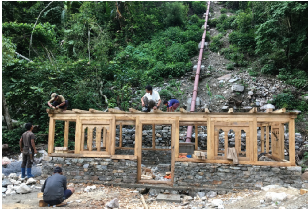
Installation of Hydro Power Project in Dali, Zhemgang