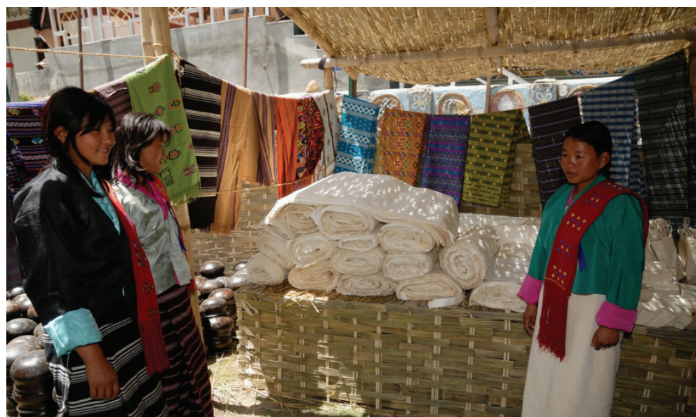
Community member of Lhop displaying her products