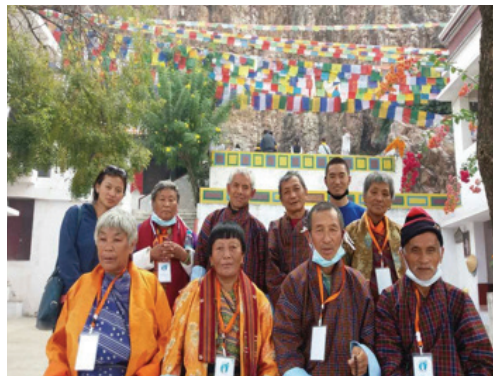
Eight Senior Citizens for their pilgrimage tour at Bodhgaya