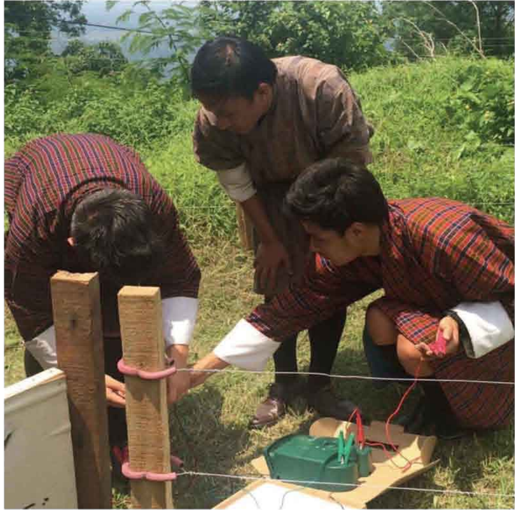
Students of CST demonstrating their project on Solar Fencing

In collaboration with the College of Science and Technology (CST), Rinchending, the 4 th Annual Green Technology Challenge was held at CST premises on 2 nd June, 2016. This initiative was started in 2013, with the intention of contributing towards our national goal of remaining carbon neutral as well as giving a platform to showcase innovation and creativity of our future engineers toward efficient technologies that would benefit rural communities.