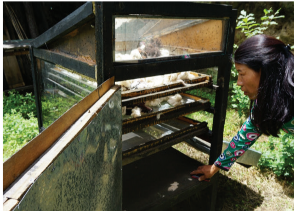
Installation of solar dryer in Tsentok, Paro

The self help group in Tsento Geog has learnt to fabricate solar dryers with technical support from the solar dryer group of Dagana and have manufactured 45 solar dryers. 129 households in Zamsar(35hhs), Chungjey(35hhs) and Namjey(40hhs) have benefitted from this initiative as the dryers are used to preserve excess produce for consumption and sale during lean season. The project was funded by UN Women.