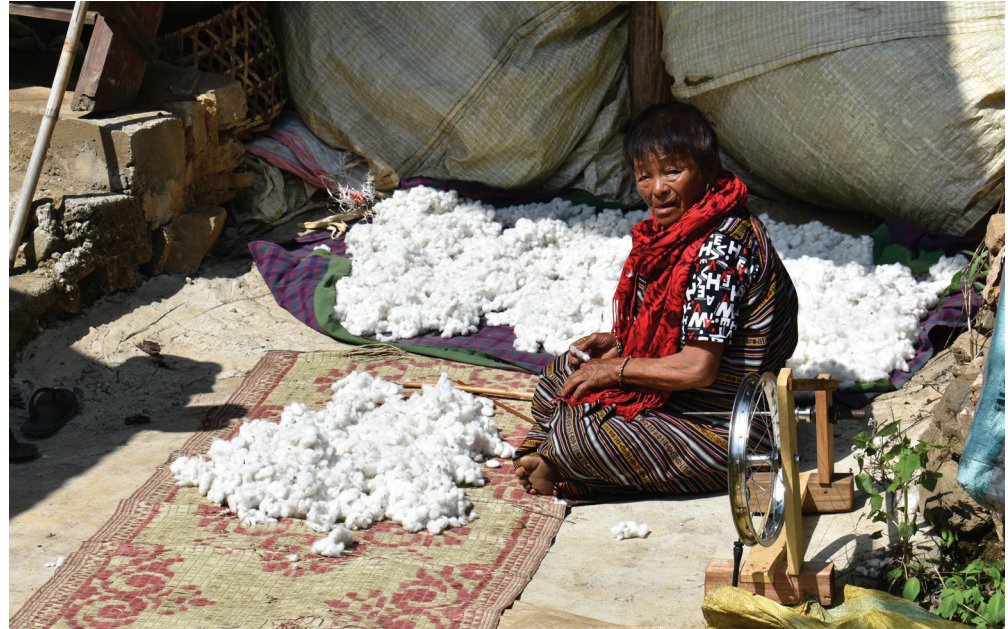
Cotton plantation in the Chhimoong Gweog, Pemagatshel

The Foundation's second objective is to support rural communities with sustainable income generating activities for improved livelihoods. The economic development programmes include skills development of the communities, promoting income generating activities and market facilitation of the products and produces.