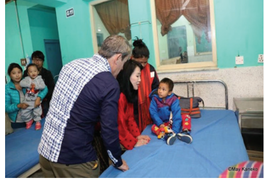
Her Majesty the Gyalyum visiting a child patient in Paro, Smile Asia

Surgicorp International, USA conducted their 10 th restorative surgical camp for the correction of cleft lips, cleft palates, burn patients and people mauled by wild animals was conducted from 23 rd April to 3 rd May 2016 at Paro Hospital. 63 patients underwent surgery out of the 169 that were screened. 149 senior citizens received injections to relieve arthritis while 100 patients underwent eye-check up and were provided with glasses free of cost.