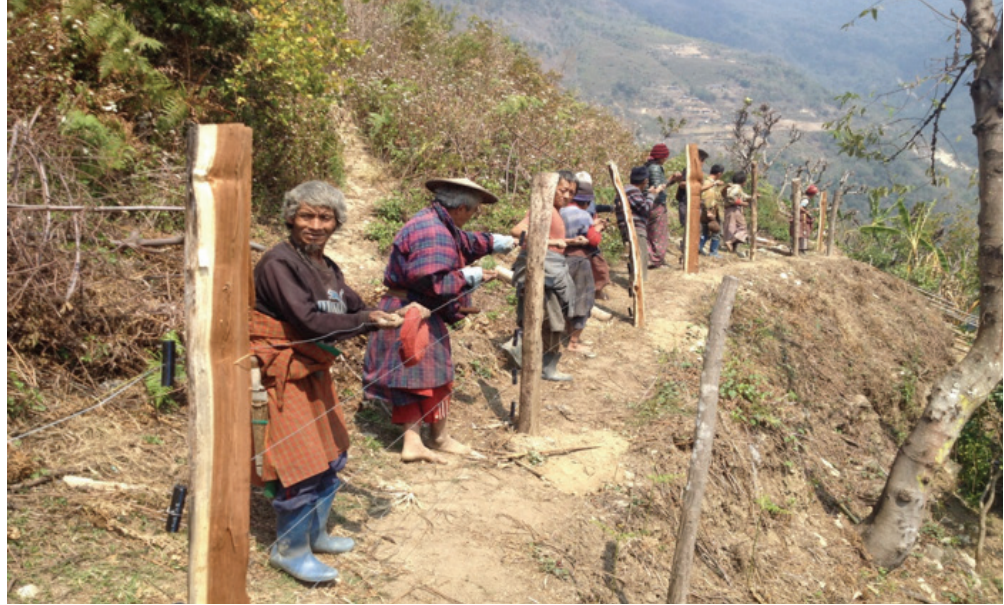
Installation of solar fencing in the community Salipong, Silambi Gewog Monggar

Farmers have claimed that they have been able to harvest their crops without any loss to wild animals. Earlier more than 30 percent of their crops were lost to damage by wild boars.