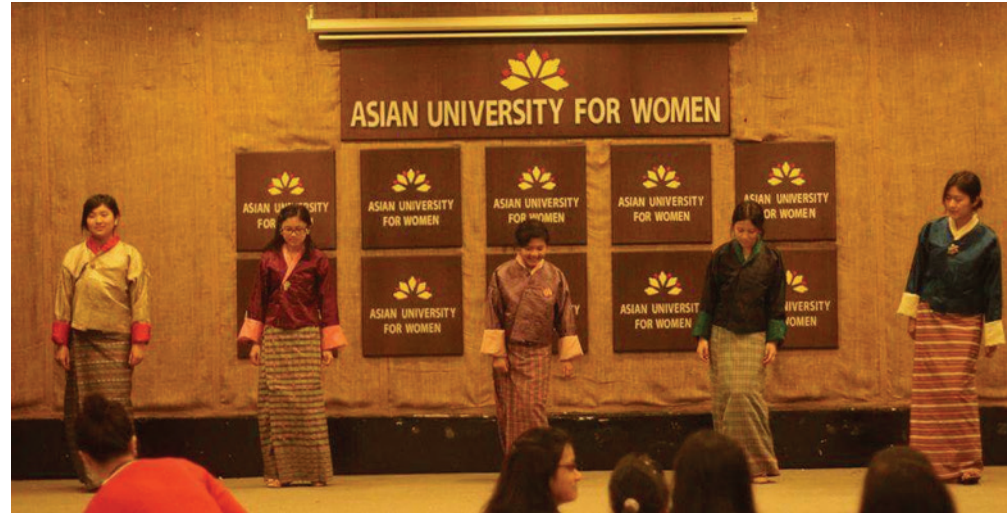
Asian University for Women Scholarship beneficiaries in Bangladesh

The Scholarship programme was put in place to enable students from disadvantaged background pursue higher education.