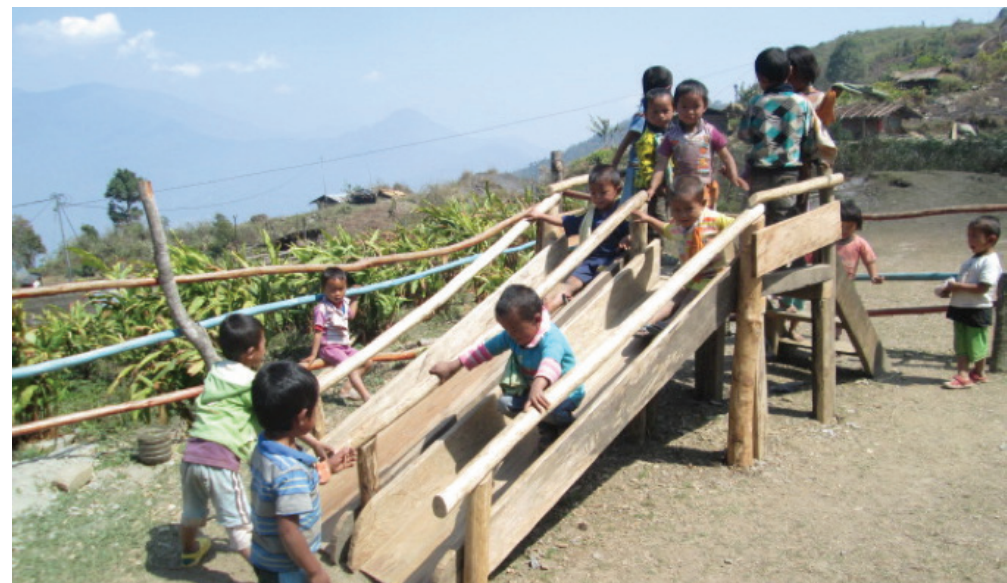
Children of Singye ECCD, Dophuchen Gewog, Samtse Dzonkhag