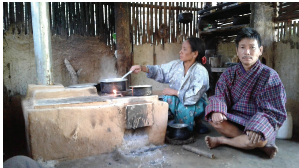
Installation of eco stove at Khempa village, Duenchukha Gewog, Samtse