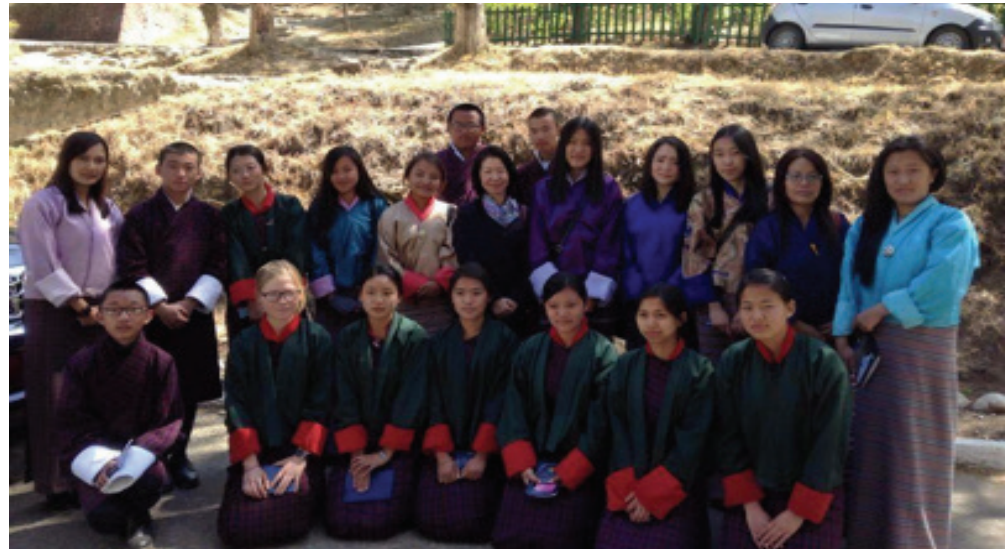
Tarayana School club, Yangchenphu Higher Secondary School

The Tarayana School club programme promotes the spirit of volunteerism and giving back to the community amongst the youth.