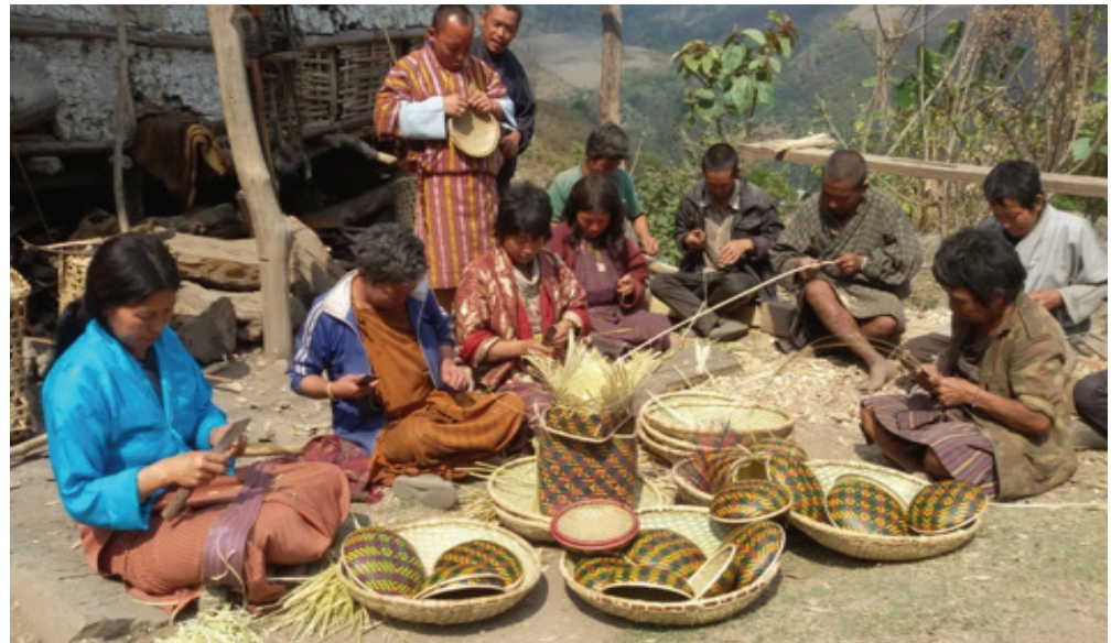
Self Help Group members in Monggar, weaving cane and bamboo baskets

Self Help Groups (SHGs) have been formed in several villages to enable them to work together for a common income generating enterprises. In 2016, 58 groups have been formed in eight Dzogkhags with 771 members. The total income earned by the groups for the year was Nu 2.2 m in 2016.