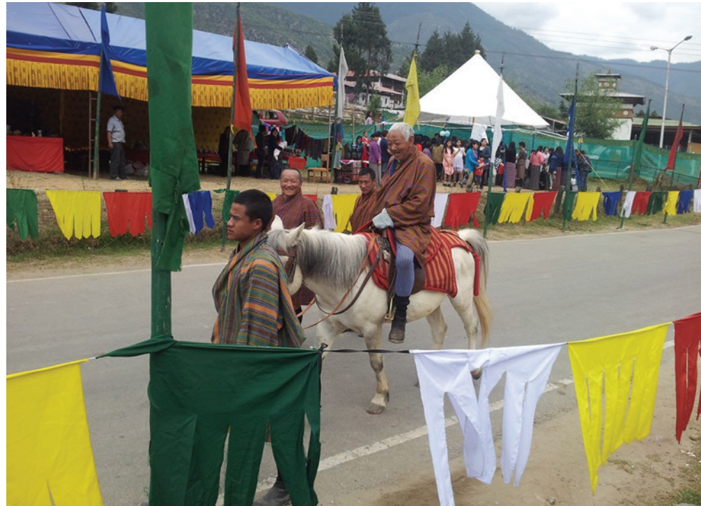
A man riding a horse during Annual Fair, 2016

The 13th Annual Tarayana fair was held at the newly inaugurated Tarayana Park, Thimphu from 6 th -8 th May 2016. The theme of the fair was “ Celebrating the Future” and was dedicated to the birth of His Royal Highness, the Gyalsey Jigme Namgyal Wangchuck.