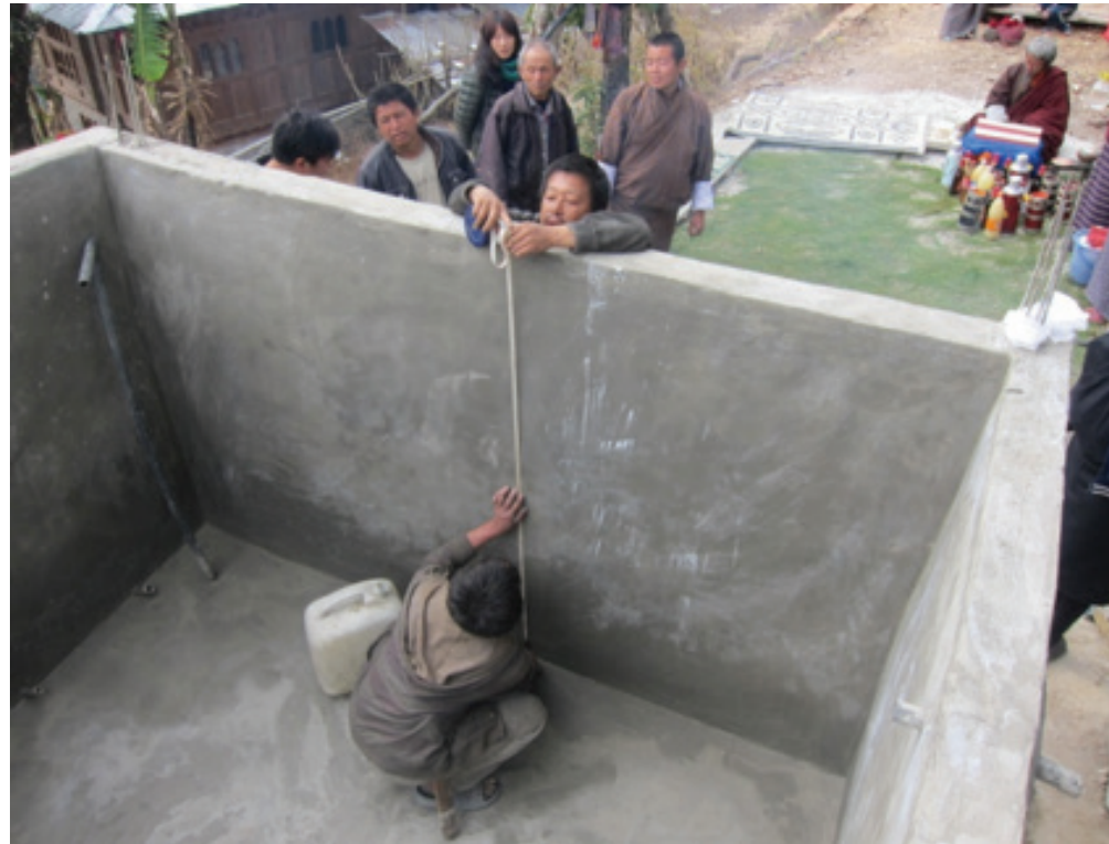
Community members of Silambi Gewog in Monggar constructing water reservoir tanks