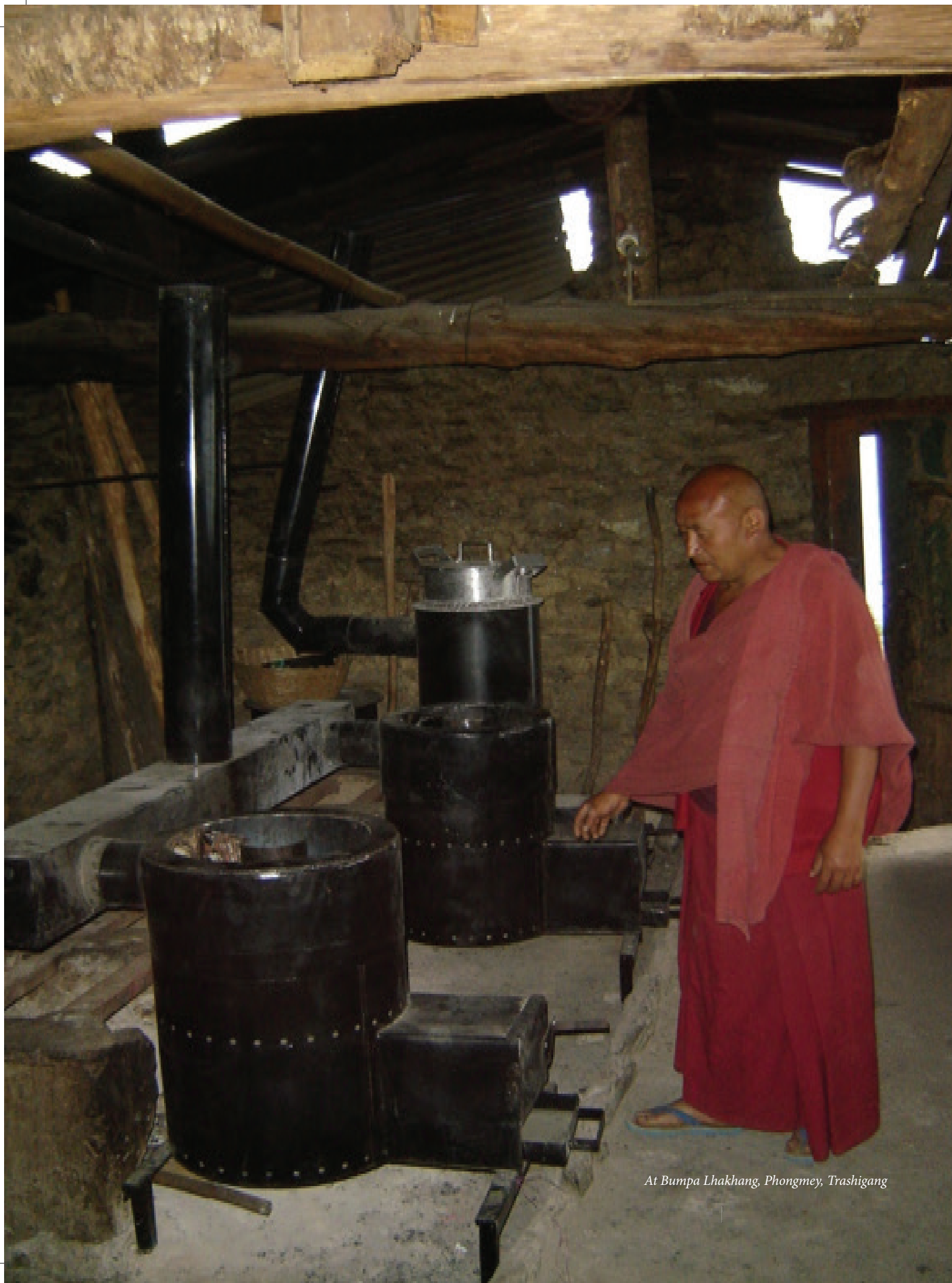
At Bumpa Lhakang, Phongmey, Trashigang