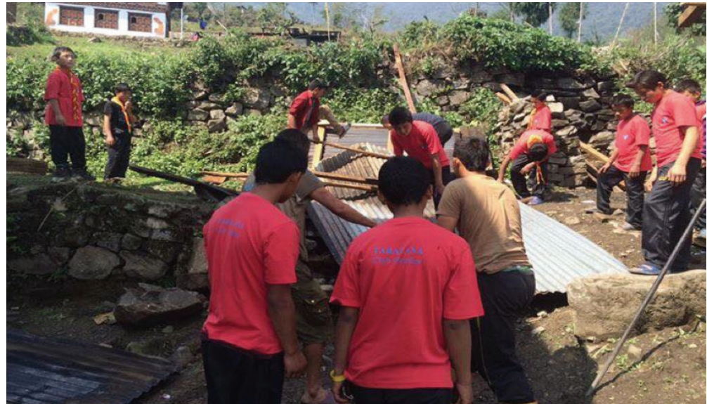
Tarayana school club members of Ranjung Central High School

The small grants projects funded by UNICEF aims to provide leadership opportunities to youth in rural and urban Bhutan by way of providing grants.