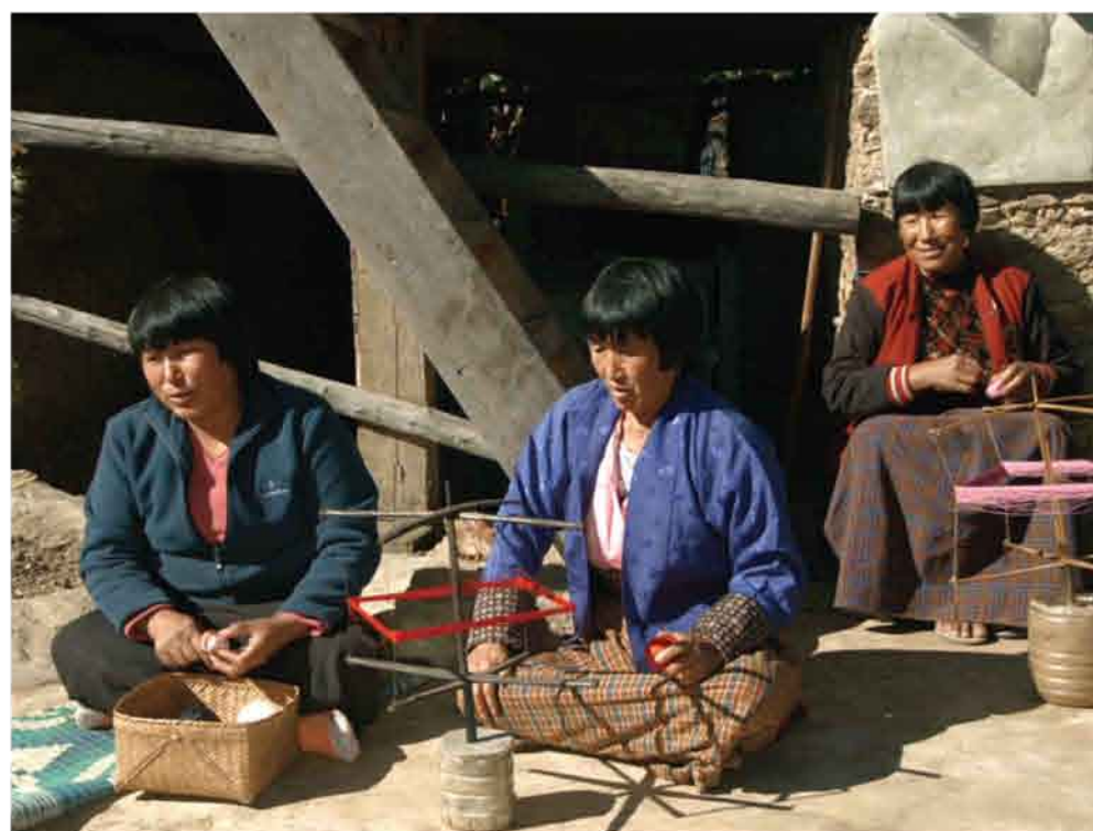
Community members engaged in common work-shed activities

The basic objective for the establishment of a common work shed is to provide collective space to work together and exchange skills among the Self Help Groups. It enables the groups to develop group cohesion, social inclusion and offers a platform for every group member to have rights in decision making. These work-sheds are also used as multipurpose halls to organize various activities for the development of the groups. Nine such work-sheds were constructed in Haa, Monggar and Trongsa in 2016 that provided opportunities for the groups to work together to increase their incomes.