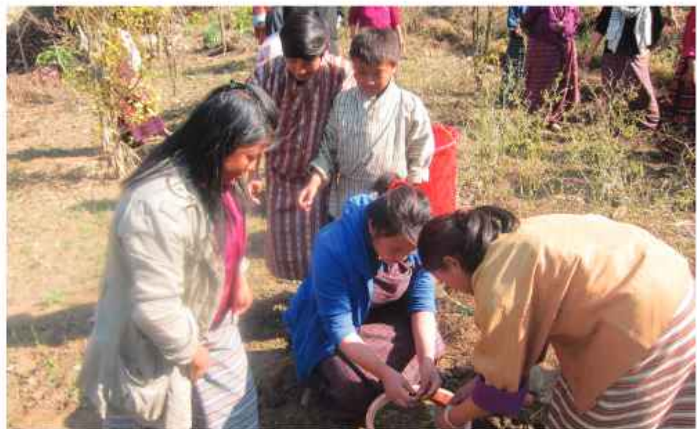
Natueco farming in the community of Chhimong, Pemagatshel

Natueco farming follows the principle of eco-system networking of nature in our farming system. It is different from organic or natural farming both in philosophy and practices. It offers an alternative to the commercial, heavy chemical techniques of farming. Along with this method of farming, incorporation and on-farm production of compost and vermi-compost is promoted in all the Tarayana intervention sites for diversified and enhanced productivity.