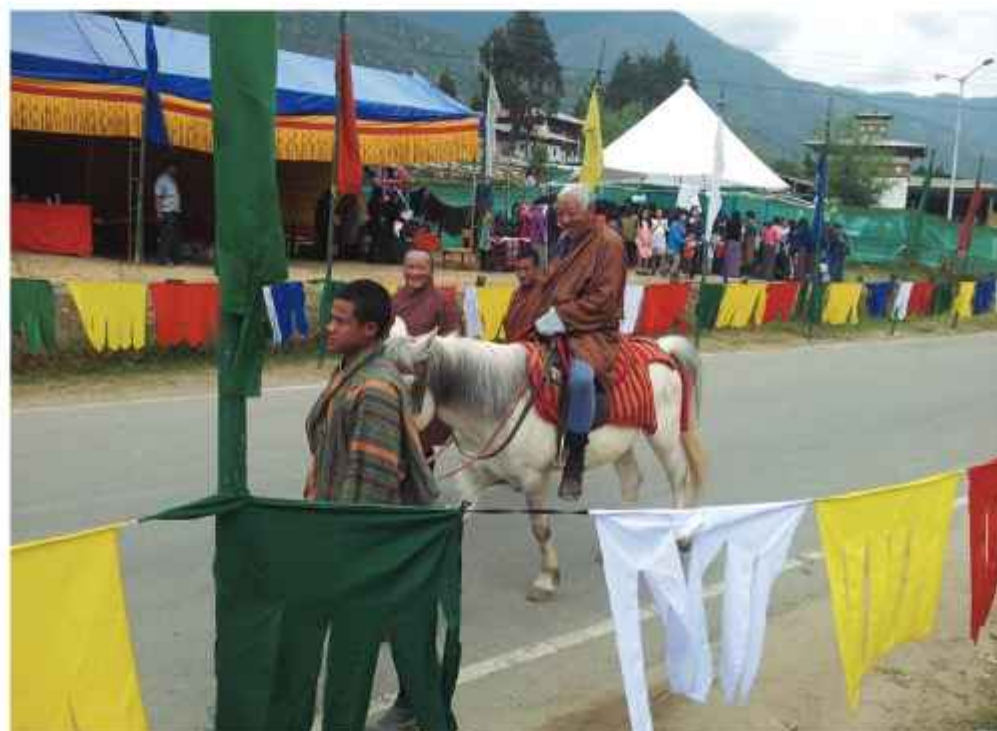
A man riding a horse during Annual Fair, 2016

The 13th Annual Tarayana fair was held at the newly inaugurated Tarayana Park, Thimphu from 6 th -8 th May 2016. The theme of the fair was "Celebrating the Future" and was dedicated to the birth of His Royal Highness, the Gyalsey Jigme Namgyal Wangchuck.