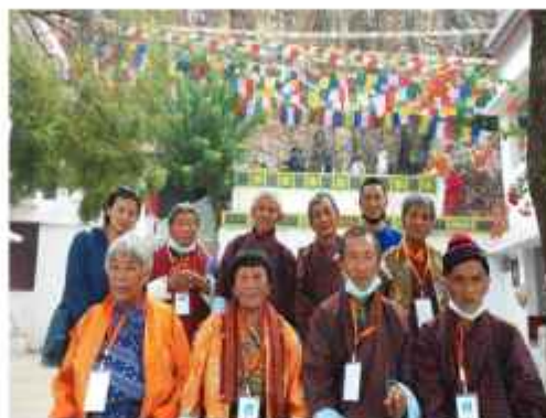
Eight Senior Citizens for their pilgrimage tour at Bodhgaya