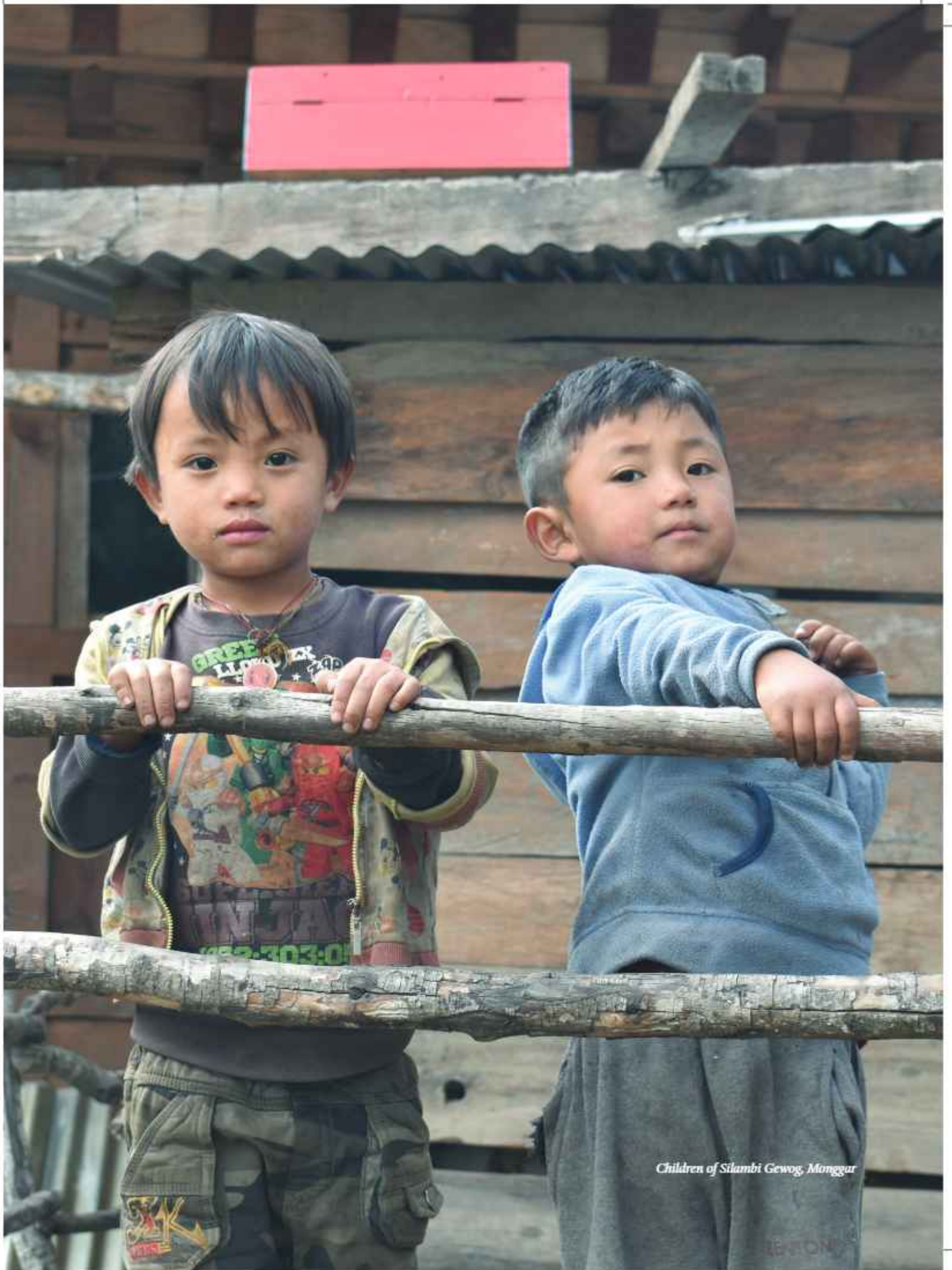
Children of Silambi Gewog, Monggar