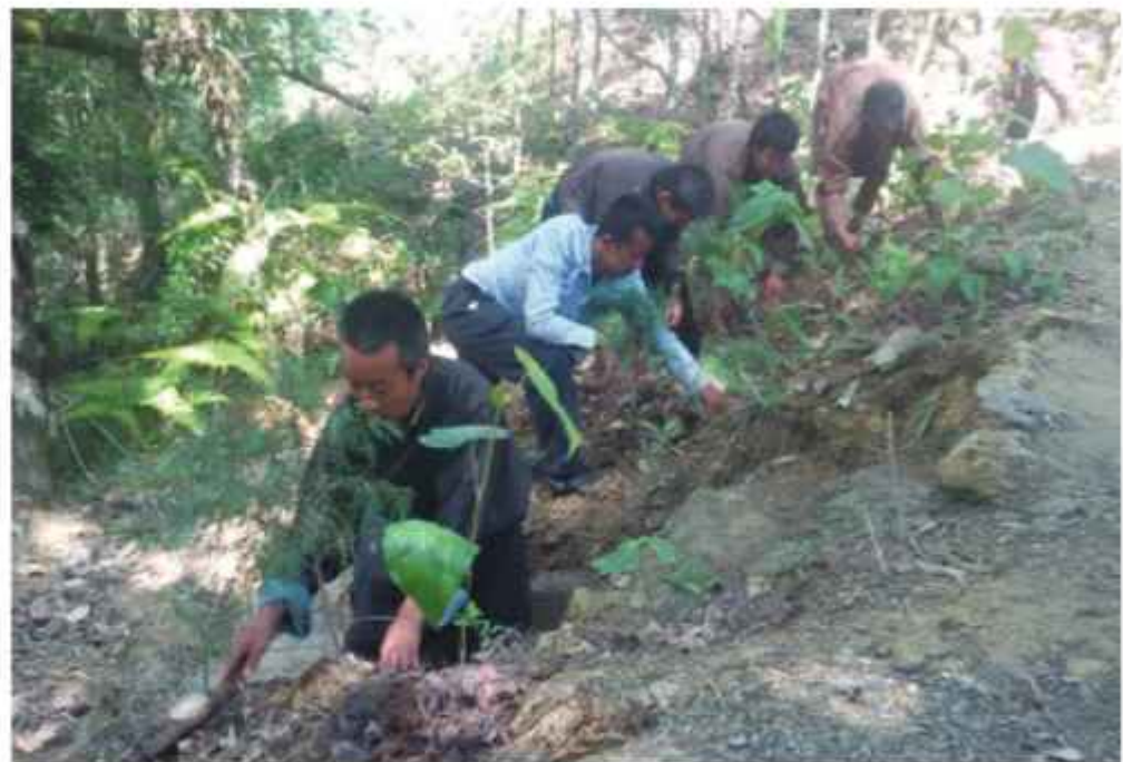
Community members of Silambi Gewog in Monggar planting Napier plants