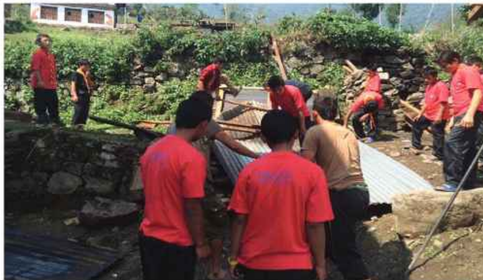
Tarayana school club members of Ranjung Central High School

The small grants projects funded by UNICEF aims to provide leadership opportunities to youth in rural and urban Bhutan by way of providing grants.