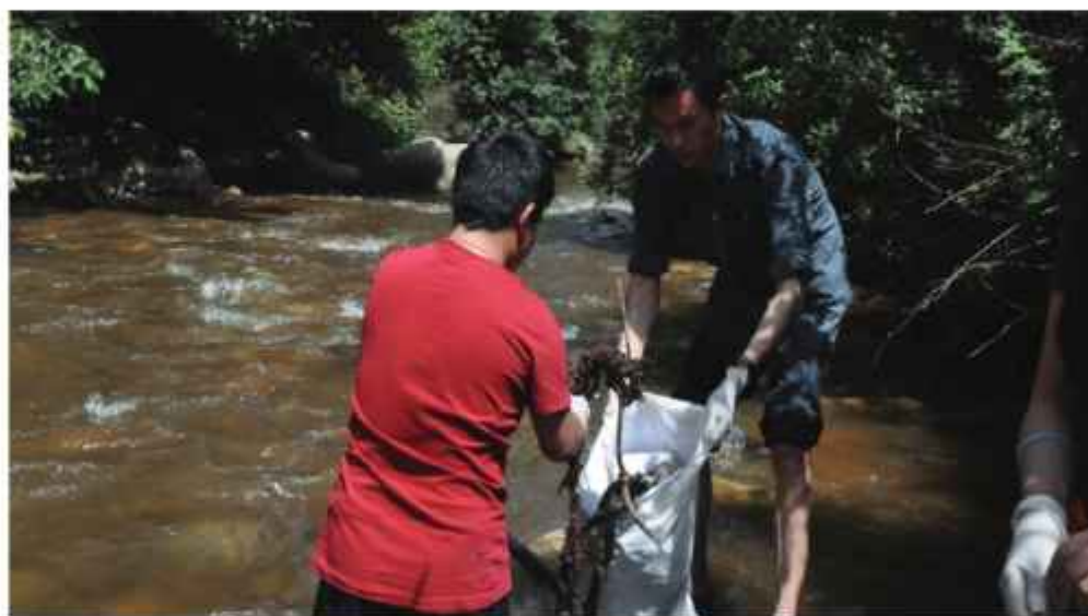
Adoption of Olarong stream by Zhenphen Social Service Committee , Royal Institute of Management(RIM)