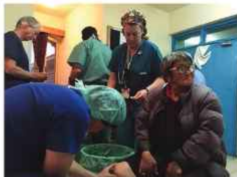
Surgicorp international, USA at Paro