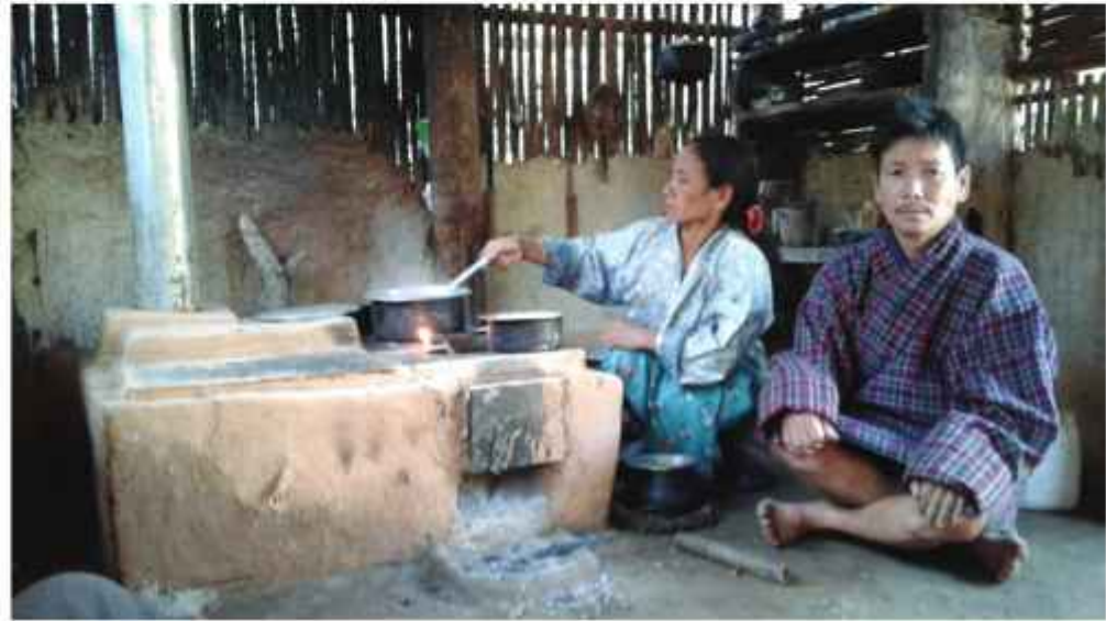
Installation of eco stove at Khempa village, Duenchukha Gewog, Samtse