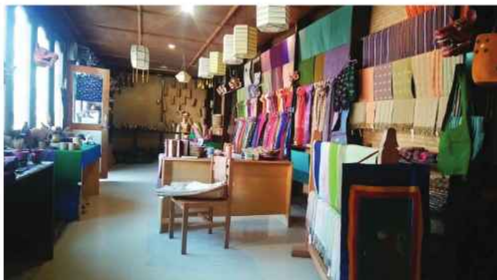
Tarayana Rural Crafts Outlet in Chabchu, Thimphu