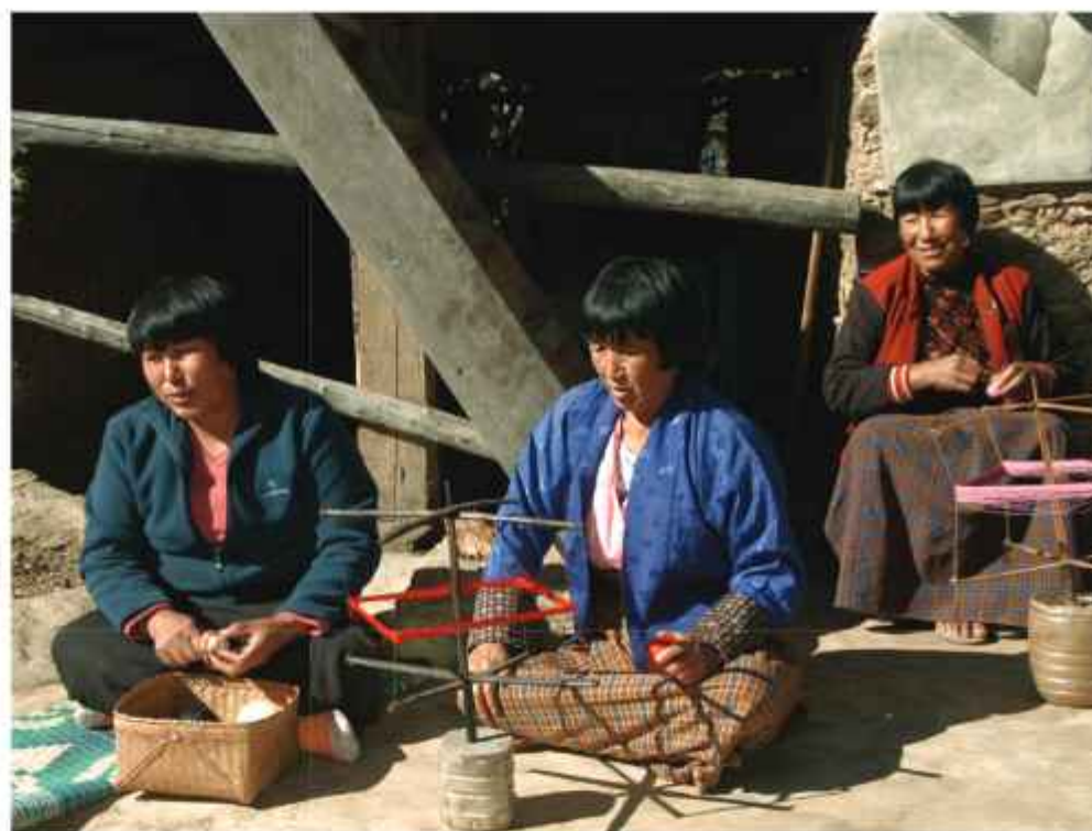
Community members engaged in common work-shed activities

The basic objective for the establishment of a common work shed is to provide collective space to work together and exchange skills among the Self Help Groups. It enables the groups to develop group cohesion, social inclusion and offers a platform for every group member to have rights in decision making. These work-sheds are also used as multipurpose halls to organize various activities for the development of the groups. Nine such work-sheds were constructed in Haa, Monggar and Trongsa in 2016 that provided opportunities for the groups to work together to increase their incomes.