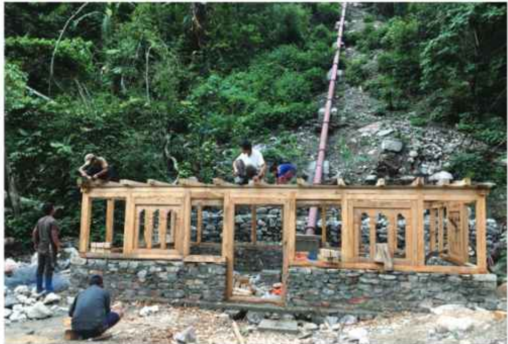
Installation of Hydro Power Project in Dali, Zhemgang