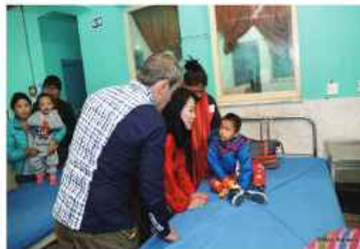
Her Majesty the Gyalyum visiting a child patient in Paro, Smile Asia

Surgicorp International, USA conducted their 10 th restorative surgical camp for the correction of cleft lips, cleft palates, burn patients and people mauled by wild animals was conducted from 23 rd April to 3 rd May 2016 at Paro Hospital. 63 patients underwent surgery out of the 169 that were screened. 149 senior citizens received injections to relieve arthritis while 100 patients underwent eye-check up and were provided with glasses free of cost.