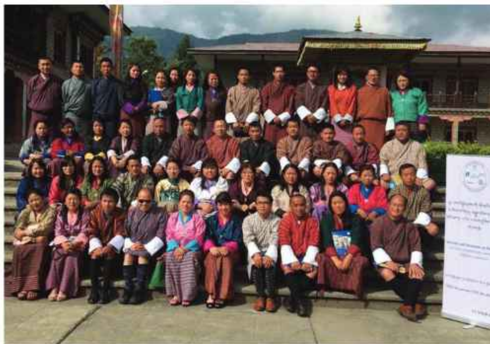
Group picture of participants of Social Inclusion Program Workshop

The Social Inclusion Program seeks to facilitate opportunities for differently-abled people to participate actively in all spheres of life. It's about expanding individuals' life opportunities through education, training and employment.