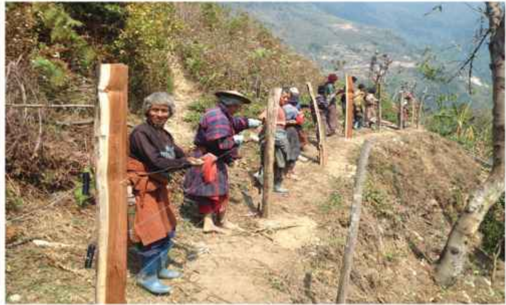
Installation of solar fencing in the community Salipong, Silambi Gewog Monggar

Farmers have claimed that they have been able to harvest their crops without any loss to wild animals. Earlier more than 30 percent of their crops were lost to damage by wild boars.