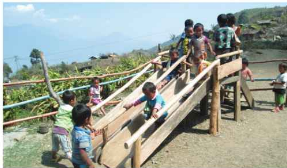
Children of Singye ECCD, Dophuchen Gewog, Samtse Dzongkhag