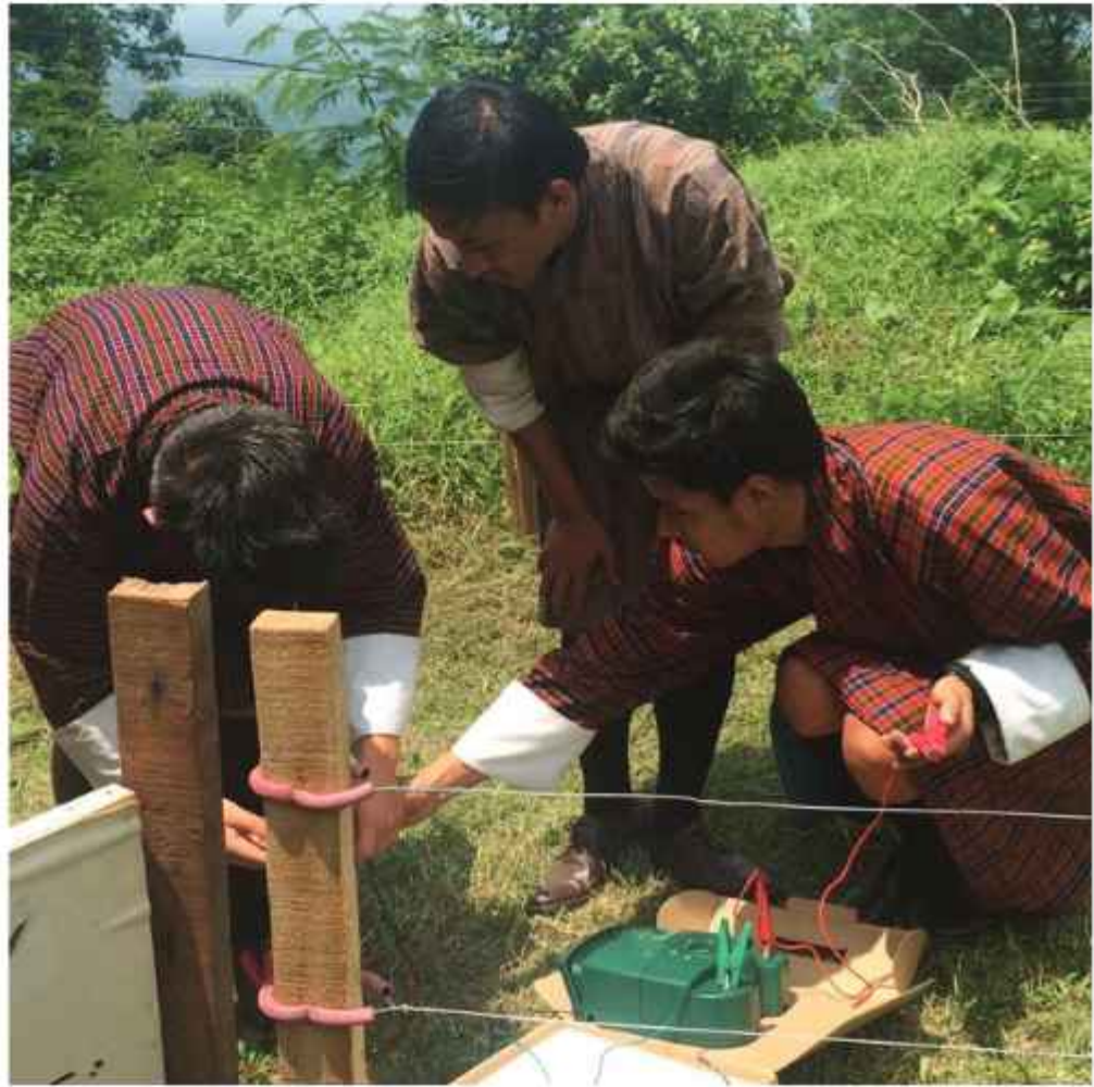
Students of CST demonstrating their project on Solar Dryer

In collaboration with the College of Science and Technology (CST), Rinchending, the 4 th Annual Green Technology Challenge was held at CST premises on 2 nd June, 2016. This initiative was started in 2013, with the intention of contributing towards our national goal of remaining carbon neutral as well as giving a platform to showcase innovation and creativity of our future engineers toward efficient technologies that would benefit rural communities.