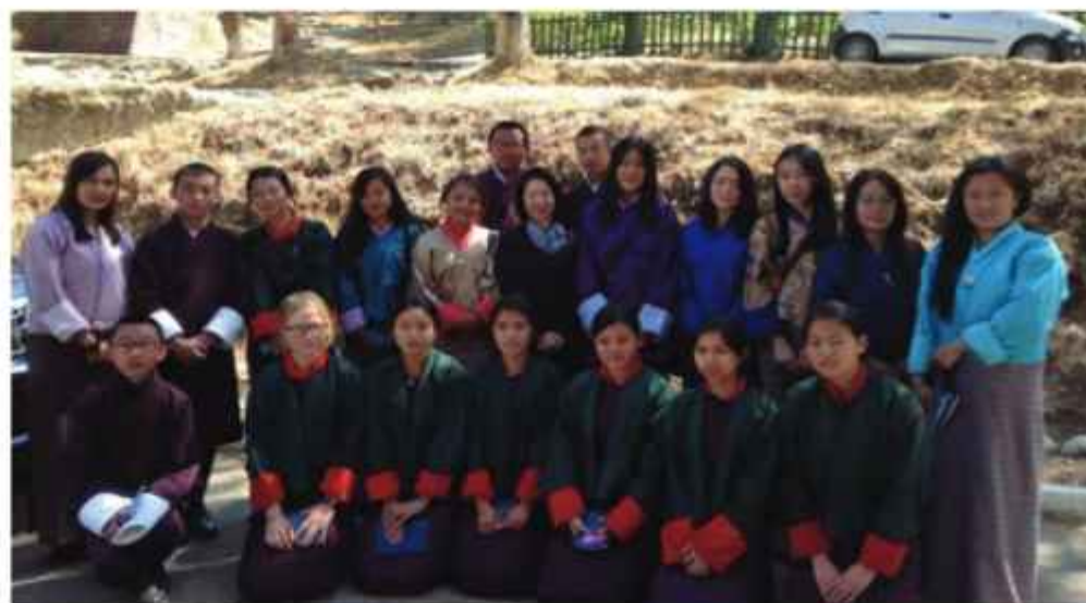
Tarayana School club, Yangchenphu Higher Secondary School

The Tarayana School club programme promotes the spirit of volunteerism and giving back to the community amongst the youth.