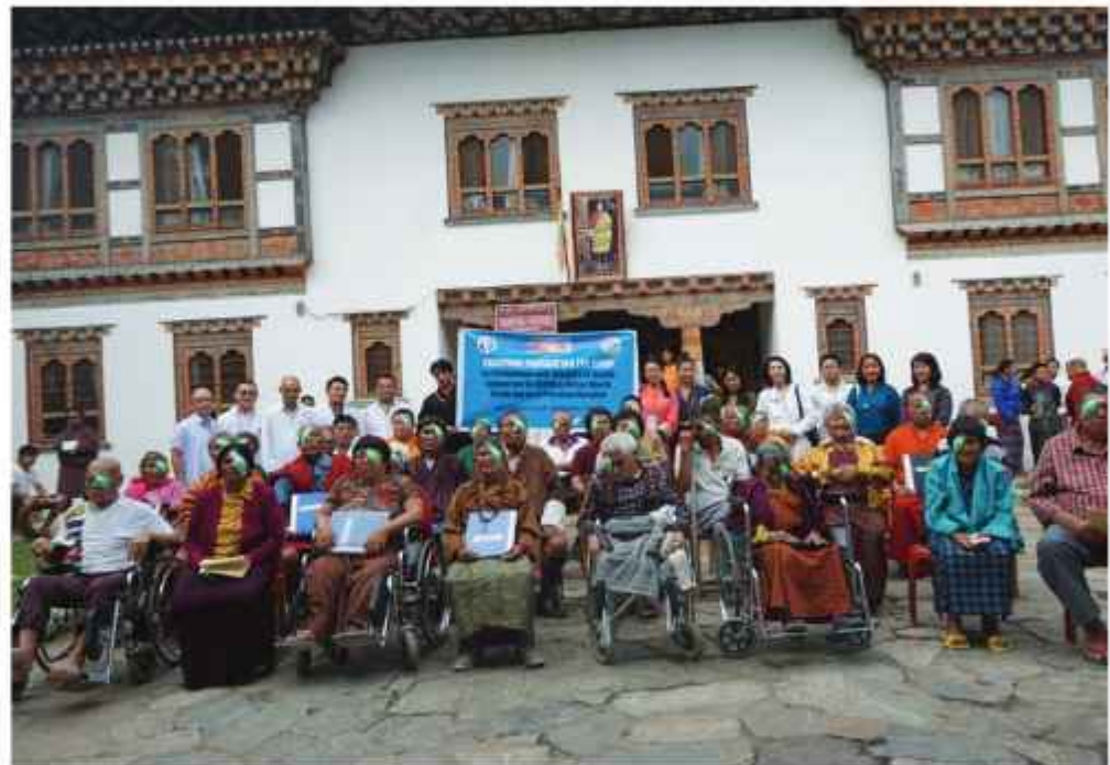
Cataract Surgery Camp in Punakha