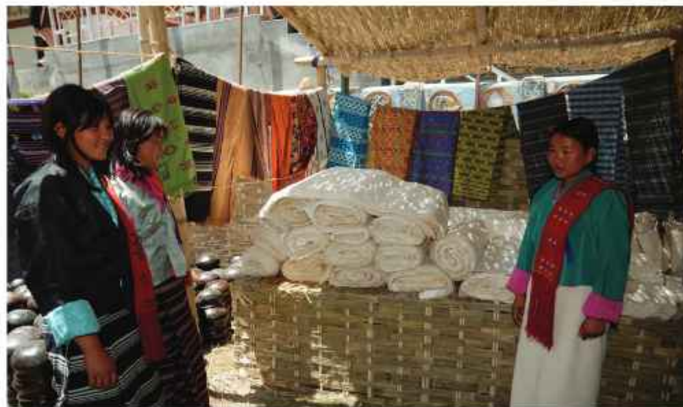
Community member of Lhop displaying her products