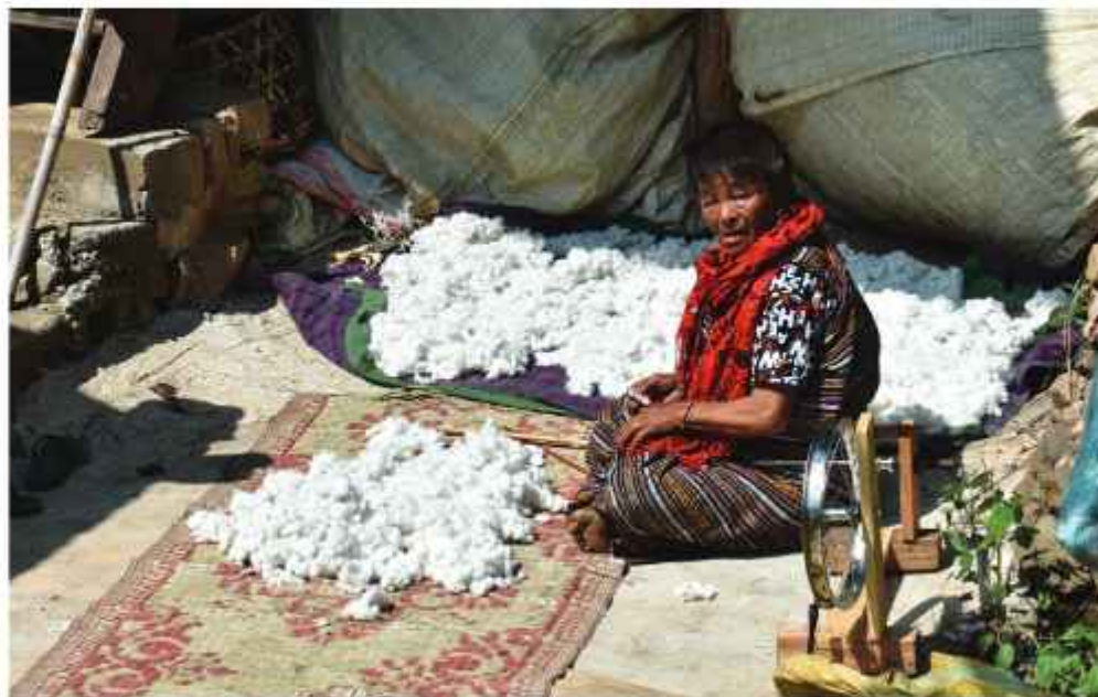
Cotton plantation in the Chhimoong Gweog, Pemagatshel

The Foundation's second objective is to support rural communities with sustainable income generating activities for improved livelihoods. The economic development programmes include skills development of the communities, promoting income generating activities and market facilitation of the products and produces.