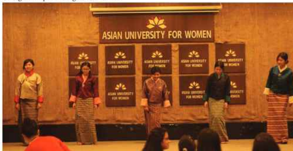
Asian University for Women Scholarship beneficiaries in Bangladesh

The Scholarship programme was put in place to enable students from disadvantaged background pursue higher education.