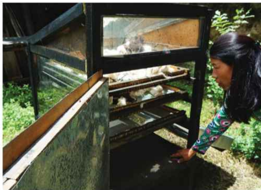
Installation of solar dryer in Tsentok, Paro

The self help group in Tsento Geog has learnt to fabricate solar dryers with technical support from the solar dryer group of Dagana and have manufactured 45 solar dryers. 129 households in Zamsar(35hhs), Chungjey(35hhs) and Namjey(40hhs) have benefitted from this initiative as the dryers are used to preserve excess produce for consumption and sale during lean season. The project was funded by UN Women.