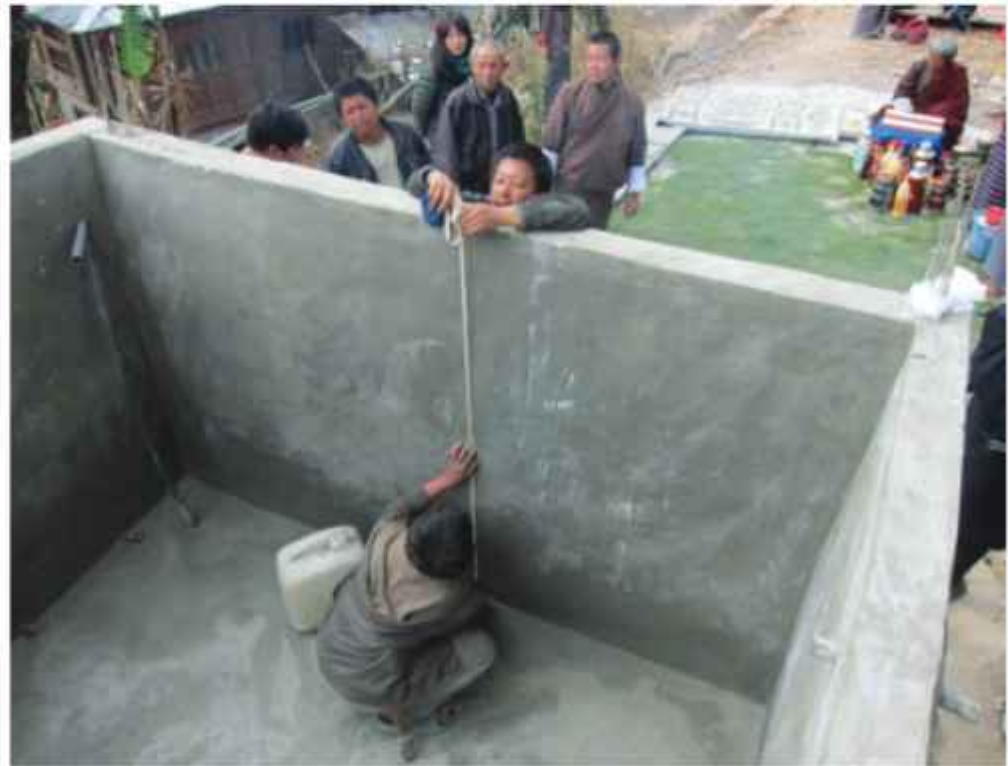
Community members of Silambi Gewog in Monggar constructing water reservoir tanks