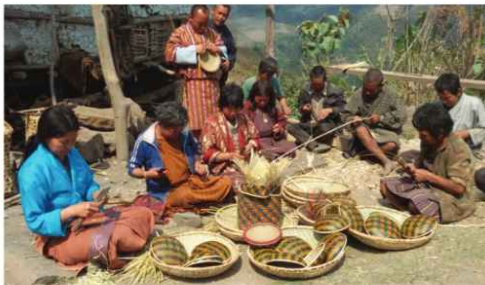
Self Help Group members in Monggar, weaving cane and bamboo baskets

Self Help Groups (SHGs) have been formed in several villages to enable them to work together for a common income generating enterprises. In 2016, 58 groups have been formed in eight Dzogkhags with 771 members. The total income earned by the groups for the year was Nu 2.2 m in 2016.