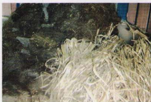
Raw material collection, Lotokuchu