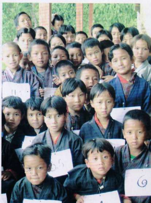
Some student beneficiaries inTaksha, Wangdiphodrang