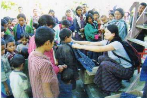
Distributing clothes in Lotokuchu donated by Import Export Houses