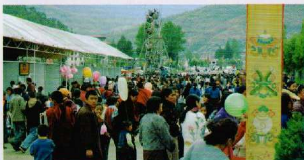
Tarayana Fair 2005

In addition some of the popular children's movies were also screened over the weekend.