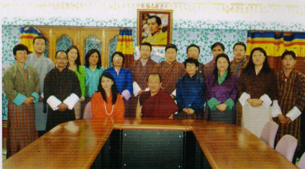
10th Board Meeting, April 14 th 06

The Secretariat prepares financial statement and reports on the progress of works of the Foundation every quarter to the Board. It implements the planned activities of the Foundation and ensures that the programmes are well coordinated. The Secretariat is responsible for the day-to-day functioning of the Foundation.