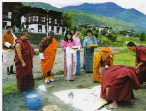
Tarayana Craft Centre and Head Office Construction Ground Breaking Ceremony, 6th Oct '05

The Centre will serve as an outlet for rural craft products coming in from the communities and will also house exhibition halls and workplaces for pottery, traditional paper making, nettle weaving, bow and arrow making and basketry. This will give visitors an opportunity to see, do and learn during their visit. Special course in these skills will also be given depending on the people's interest.