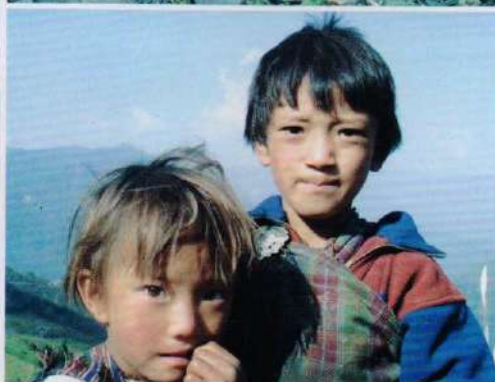
Support needed for school children in Silambi