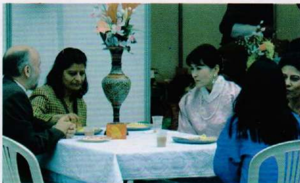
Chief Guest, HRH Ashi Kesang Wangmo Wangchuck and key Sponsors of the fair

The continued cooperation and goodwill received from the Helvetas Coordinator and his staff is gratefully acknowledged. The implementation of the Tarayana Foundation Strategic Plan 2005 – 2007 is underway and picking up steam as the team is being put together at the grassroots to mobilize the communities in helping themselves.