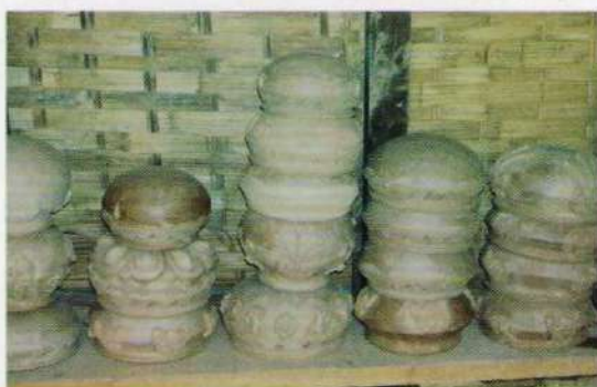
Traditional Pottery activities

The spinning of nettle into fine thread is still the biggest challenge. Time consumption in the spinning process has been identified as the single most factor shooting up the cost of production. The Foundation is currently exploring labour saving spinning devices that can reduce the spinning time and thereby the cost of production.