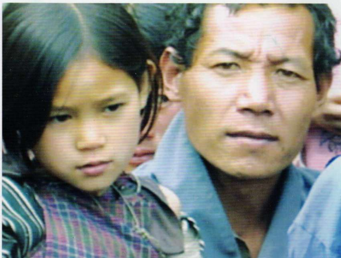
Beneficiary of Tarayana

Various groups of volunteers have been encouraged to visit out of station patients in the hospitals.