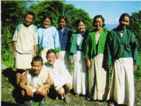
People of Lotokuchu