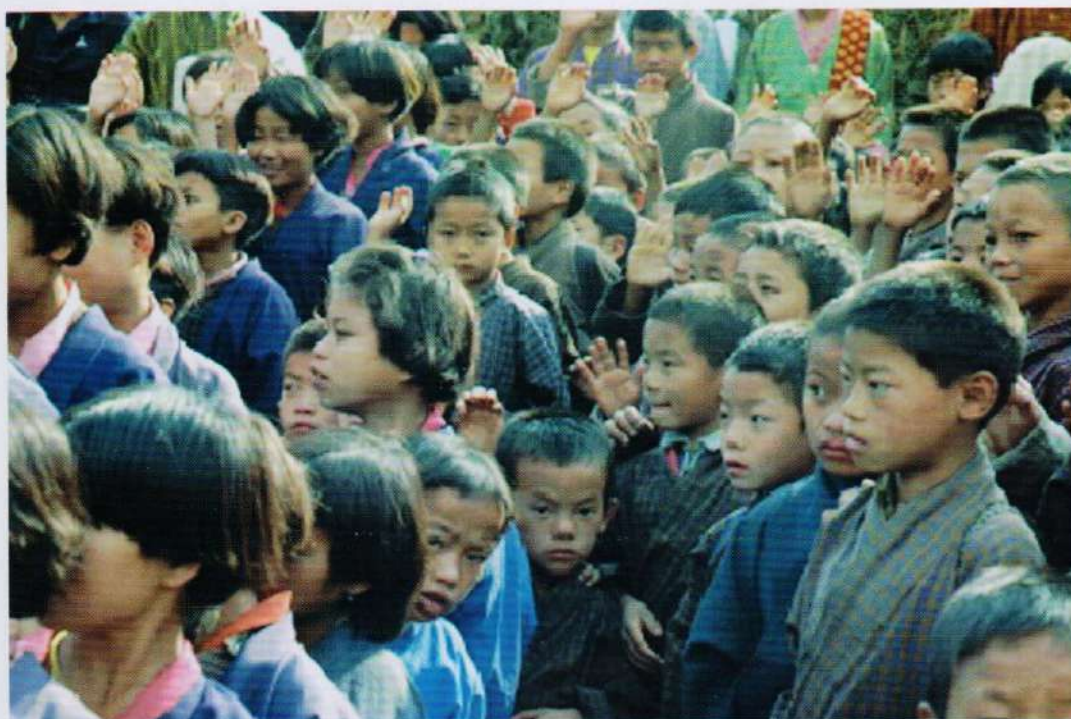
Some Students in Lotokuchu, Samtse