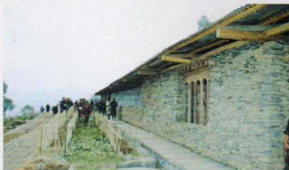
Multipurpose Workshed, Lotokuchu Jigme

Members of the Lhop community have been trained in various processes in traditional paper making and nettle weaving. Thirteen of them also underwent an eight weeks training in basic carpentry in collaboration with the Department of Human Resources. Those who underwent paper making training last year in Thimphu are also working in the community owned paper factory housed in the Multipurpose workshed.