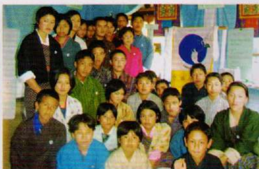
Samtengang Tarayana Club