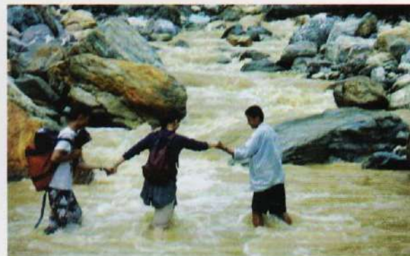
Crossing the Amo chhu to reach Lotokuchu