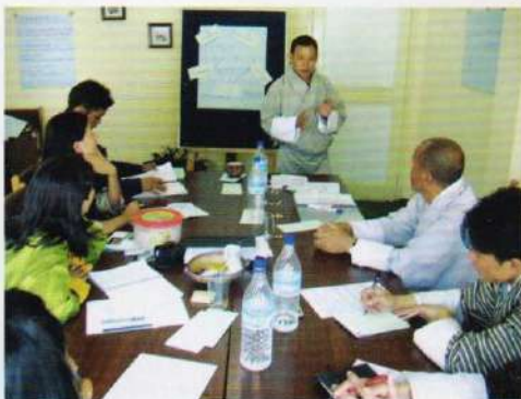
Inhouse training of Tarayana in PRA