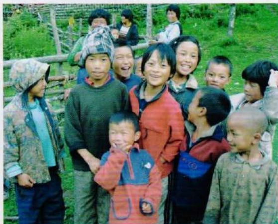
Some student beneficiaries in Chumey, Bumthang

Governments are usually not well equipped to address such specific interventions efficiently and effectively, essentially because they must be designed to meet individual needs. NGOs with an intimate knowledge of such individuals or communities, and trusted by them, have the comparative advantage to address these peoples. The Tarayana Foundation strives to address this public policy gap and complements the government's poverty eradication programme.