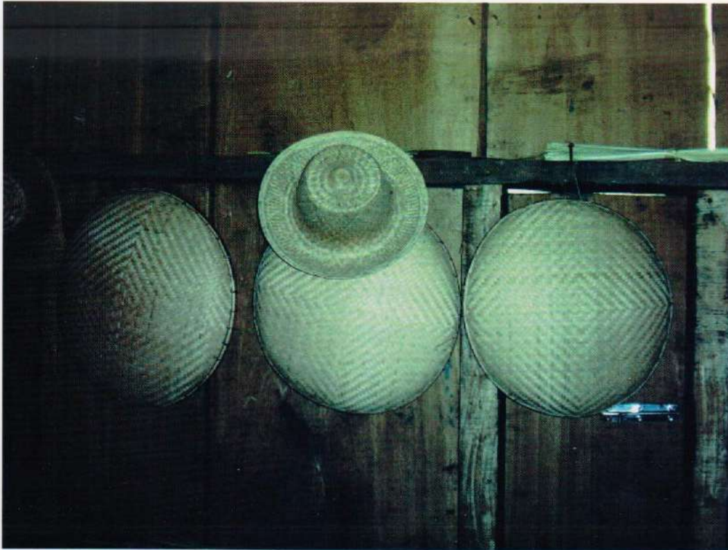
Products developed in remote communities

Skills training continue to be one of the main activities to ensure that people have employable skills thereby have opportunities for cash income generating activities.