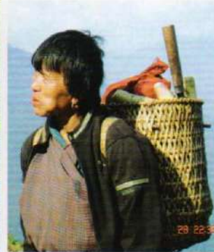
A lady heading for a day's work in her field