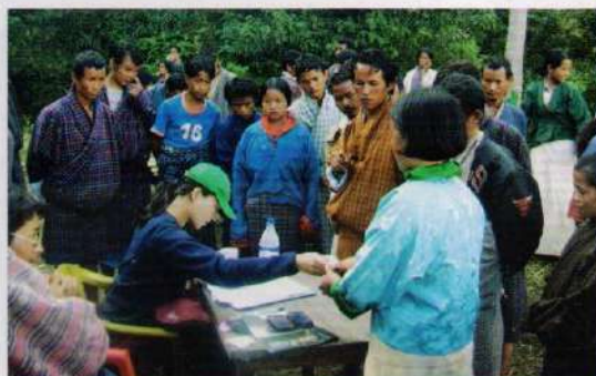
Pay day, Lotokuchu