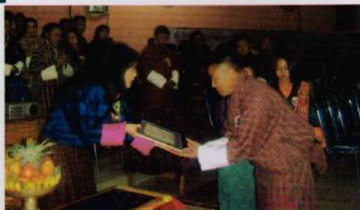
Awarding Certificates of appreciation to volunteers